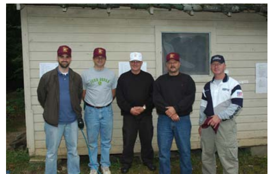
2007 MN State Match Winners

GPS: 45 Deg 23 Min 42 Sec North -93 Deg 29 Min 29 Sec West