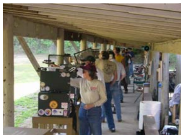
Covered Firing Points